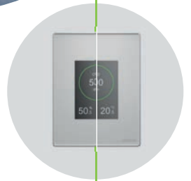
Occupiable rooms for aerobic exercise such as sports halls and gymnasiums.