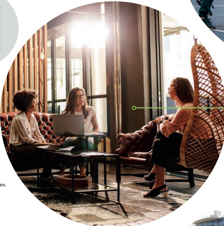
Occupiable rooms in offices.