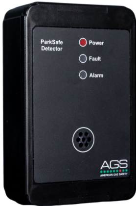
Dimensions (H x W x D) 4.92" x 3.74" x 1.38"