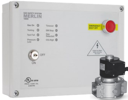
Kitchen Range Only