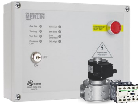
Kitchen Range Gas & Electric