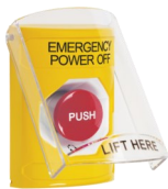
REMOTE PANIC BUTTON