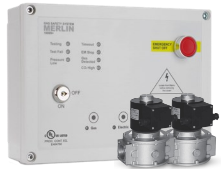
Kitchen Range Gas & Outdoor Grill