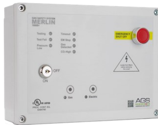
DUAL OUTPUT UTILITY CONTROL & GAS PRESSURE PROVING