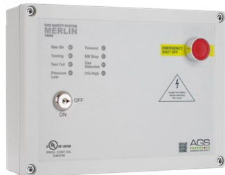
SINGLE OUTPUT UTILITY CONTROL & GAS PRESSURE PROVING