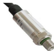
AGS Gas Pressure Transmitter

The Merlin range of gas pressure proving panels provide safe start up along with low pressure and over pressure safety.