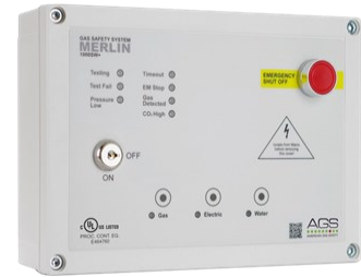
TRIPLE OUTPUT UTILITY CONTROL & GAS PRESSURE PROVING