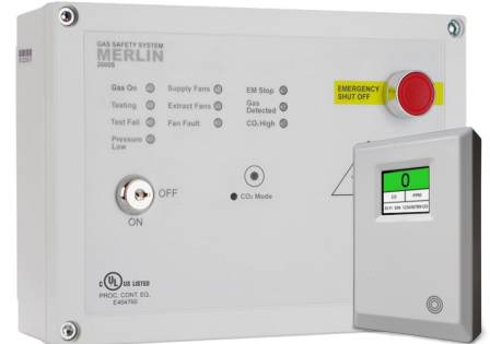
VENTILATION INTERLOCK WITH CO PROTECTION, GAS SHUT OFF & GAS PRESSURE PROVING