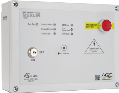
VENTILATION INTERLOCK & GAS SHUT OFF