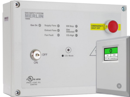
VENTILATION INTERLOCK WITH CO PROTECTION & GAS SHUT OFF