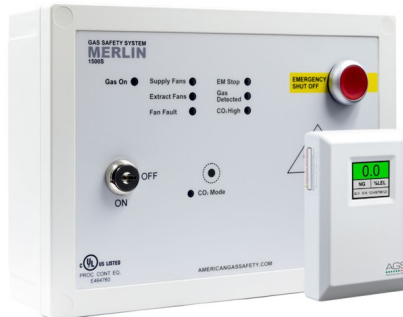
Merlin 1500S & AGSCOTFT

VENTILATION INTERLOCK WITH CO PROTECTION & GAS SHUT OFF