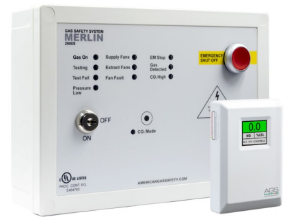
Merlin 2000S & AGSCOTFT

VENTILATION INTERLOCK WITH CO PROTECTION, GAS SHUT OFF & GAS PRESSURE PROVING